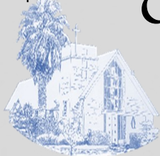
Queen of Peace Catholic Church