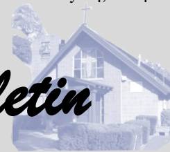
Queen of the Rosary Mission 3972 Country Club Drive Between 9th & 10th Streets

www.qopccatholicchurch.org Email: qopccclearlake@gmail.com FB: @queenofpeaceclearlake (707) 994-6618